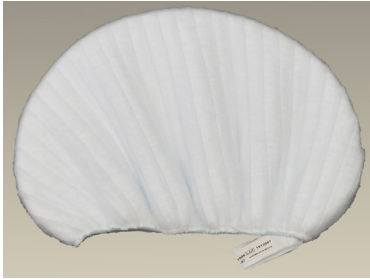
P/N 2172-97 HLF Pre-Filter REF 03731006

Before use, thoroughly read MAXAIR ® CAPR ® P/N 03521015 User Instruction (received with all CAPR Helmets and available at www.maxair-systems.com >SUPPORT>USER INSTRUCTION MANUALS.